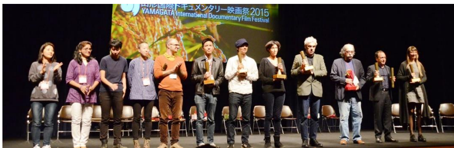
Yamagata International Documentary Festival